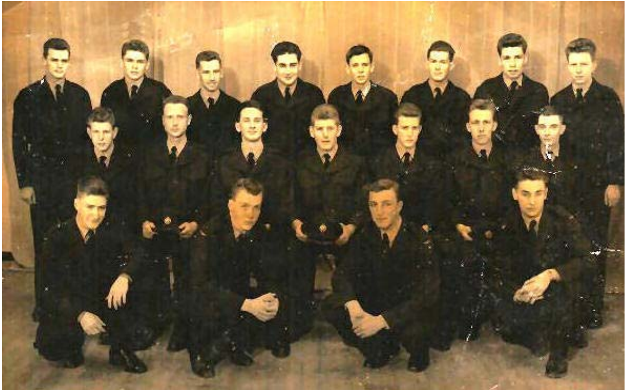
24RMC at Ballarat in 1961