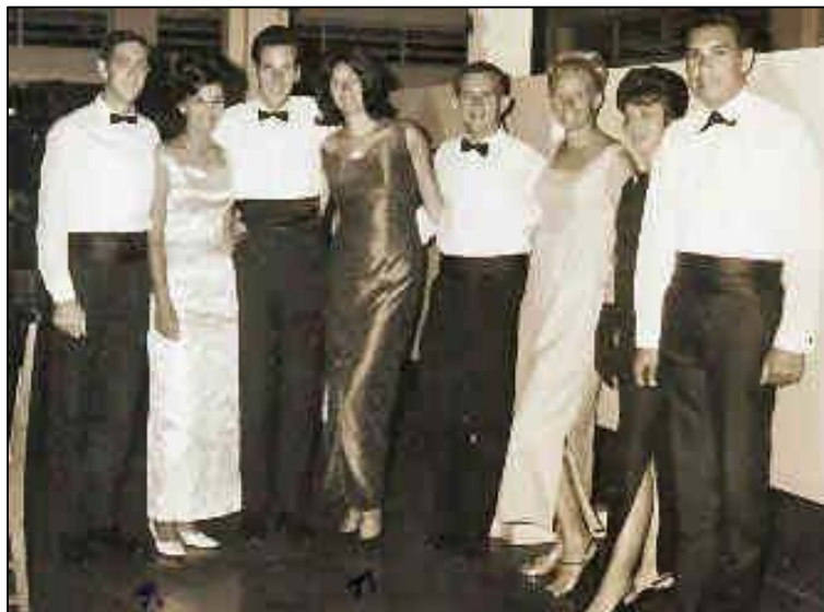
At a 2Sqn Dinner Dance at RAAF Butterworth in 1966 are:-