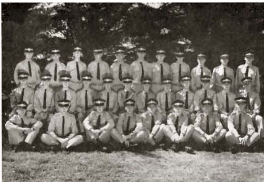
NUMBER 19 RADIO APPRENTICE COURSE.