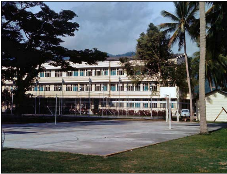
The Hostie from the beach with tennis courts - 1965.