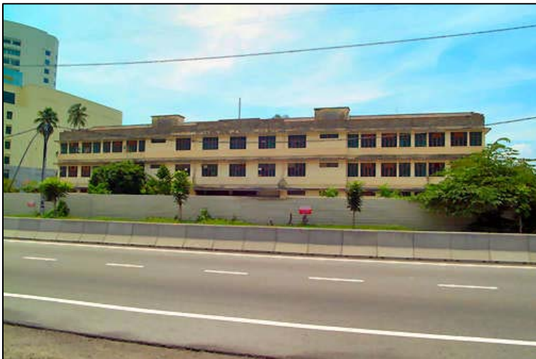
2003. The Hostie derelict and used for storing imported Ford cars.