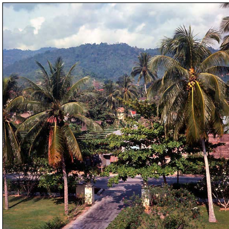
The Hostie in 1965.

Oh! Happy memories. Long live the Hostie."