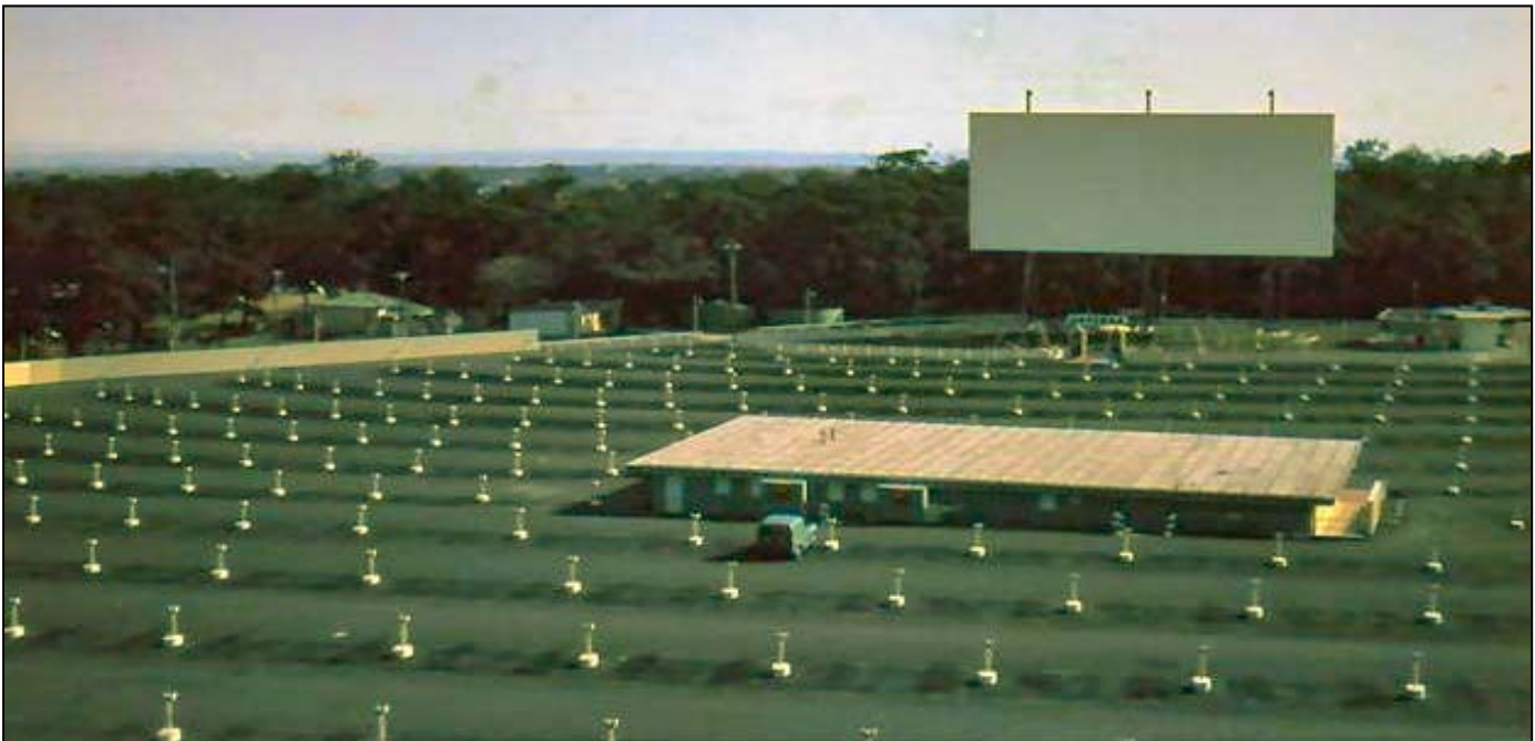
Brooky drive in – next to the Manly resort. 1963.