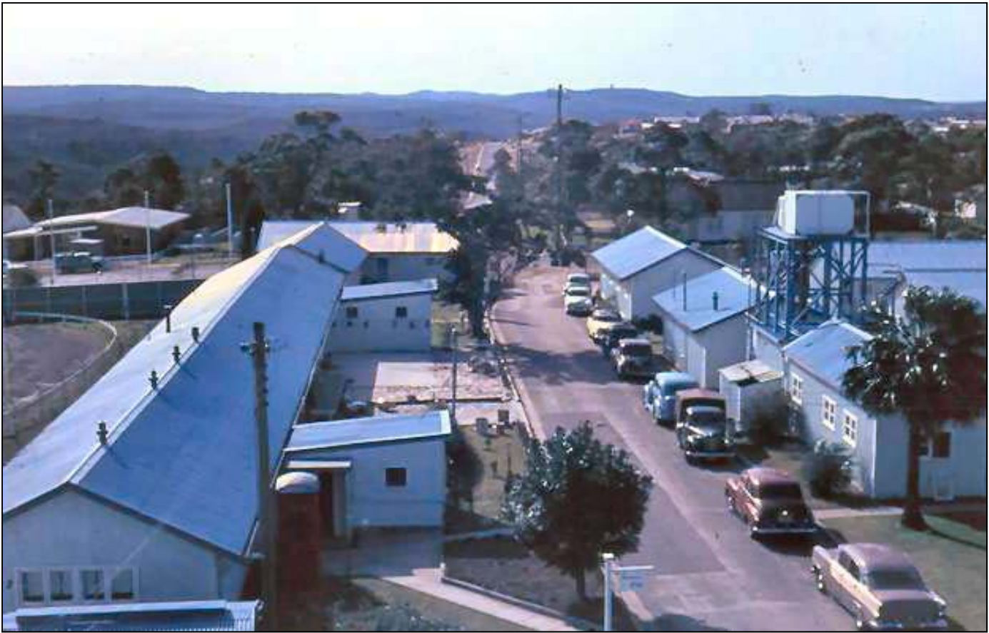
Brookvale living area, around 1963.