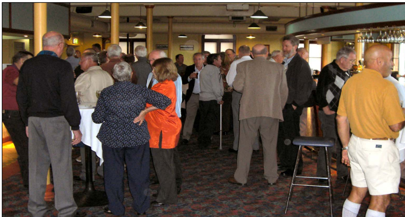
Part of the excellent roll up of Djinnang members who attended the get together.