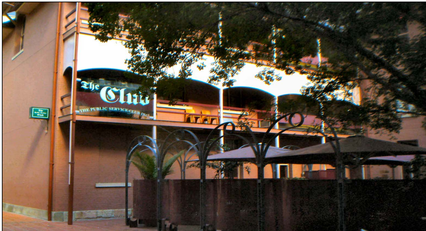
The Queensland Public Service Club, in George St Brisbane, where the re-union was held.